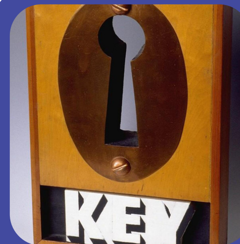
ALBERTINE MONROE-BROWN STUDY- STORAGE GALLERY (2ND FLOOR)

Imagine that you have an arrow in your hand. Start at one artwork and point it toward another that you think connects to it in some way (color, shape, idea). Explain that connection to a friend.