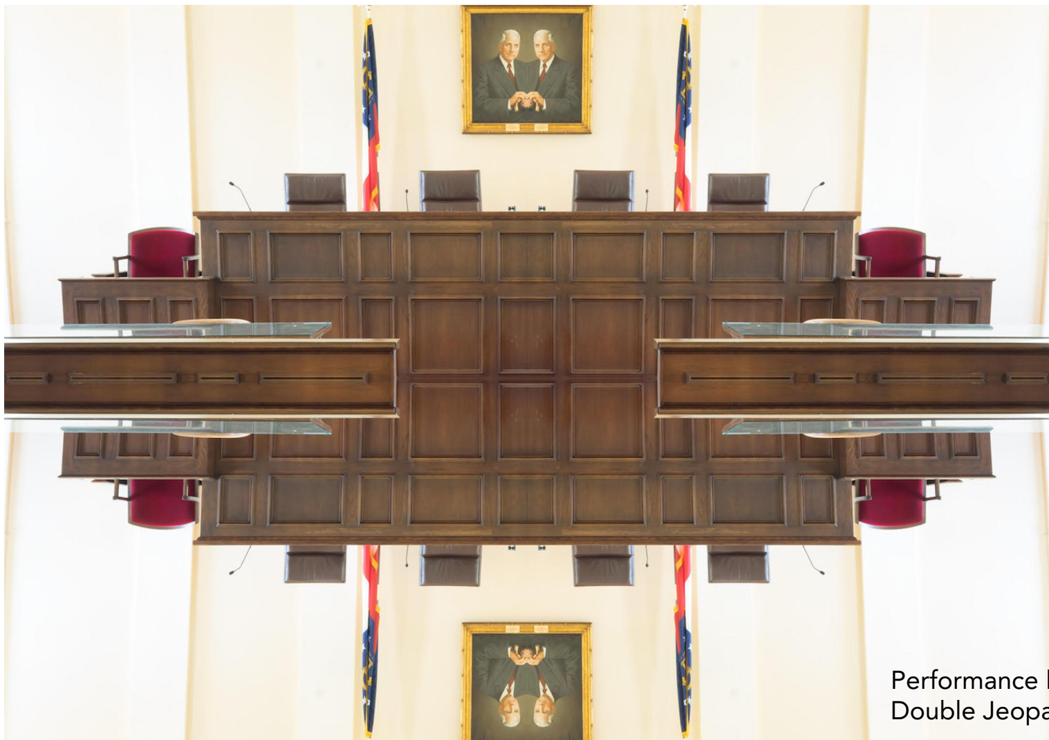
Performance lecture Double Jeopardy, 2019