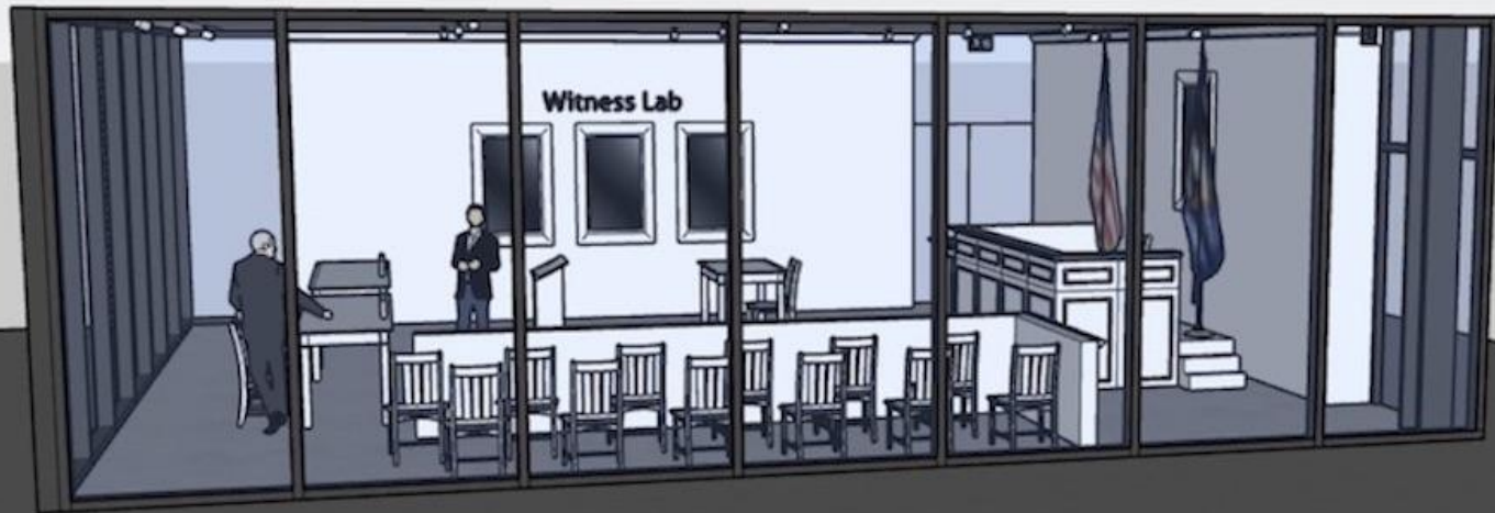
Witness Lab Sketchup Plan 2020