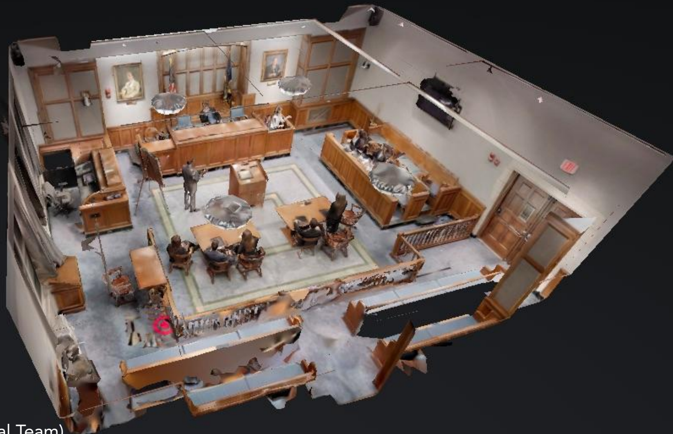
Clue (U-M Mock Trial Team) Matterport 3D 2020