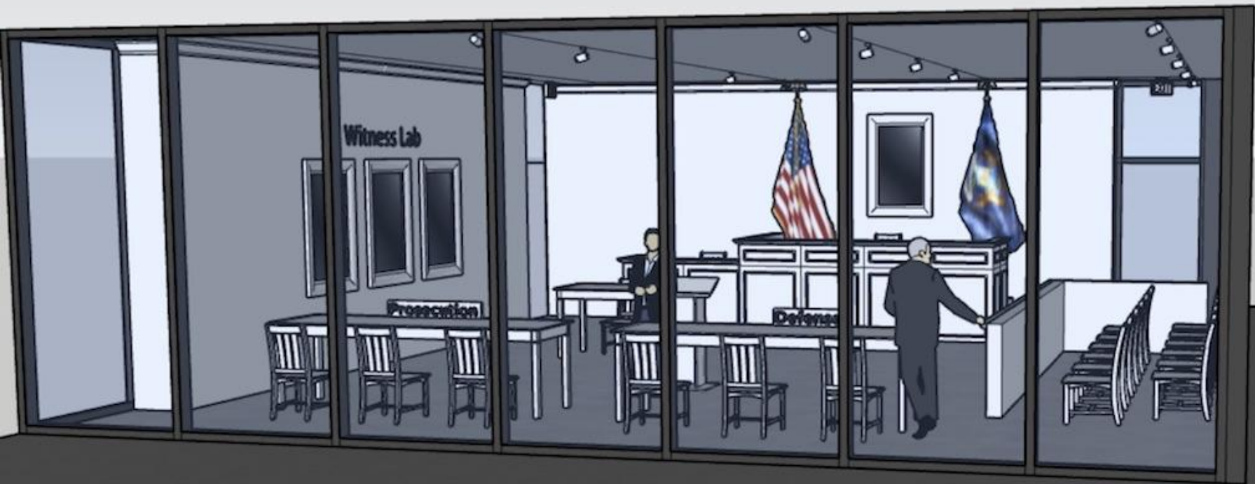
Witness Lab Sketchup Plan 2020