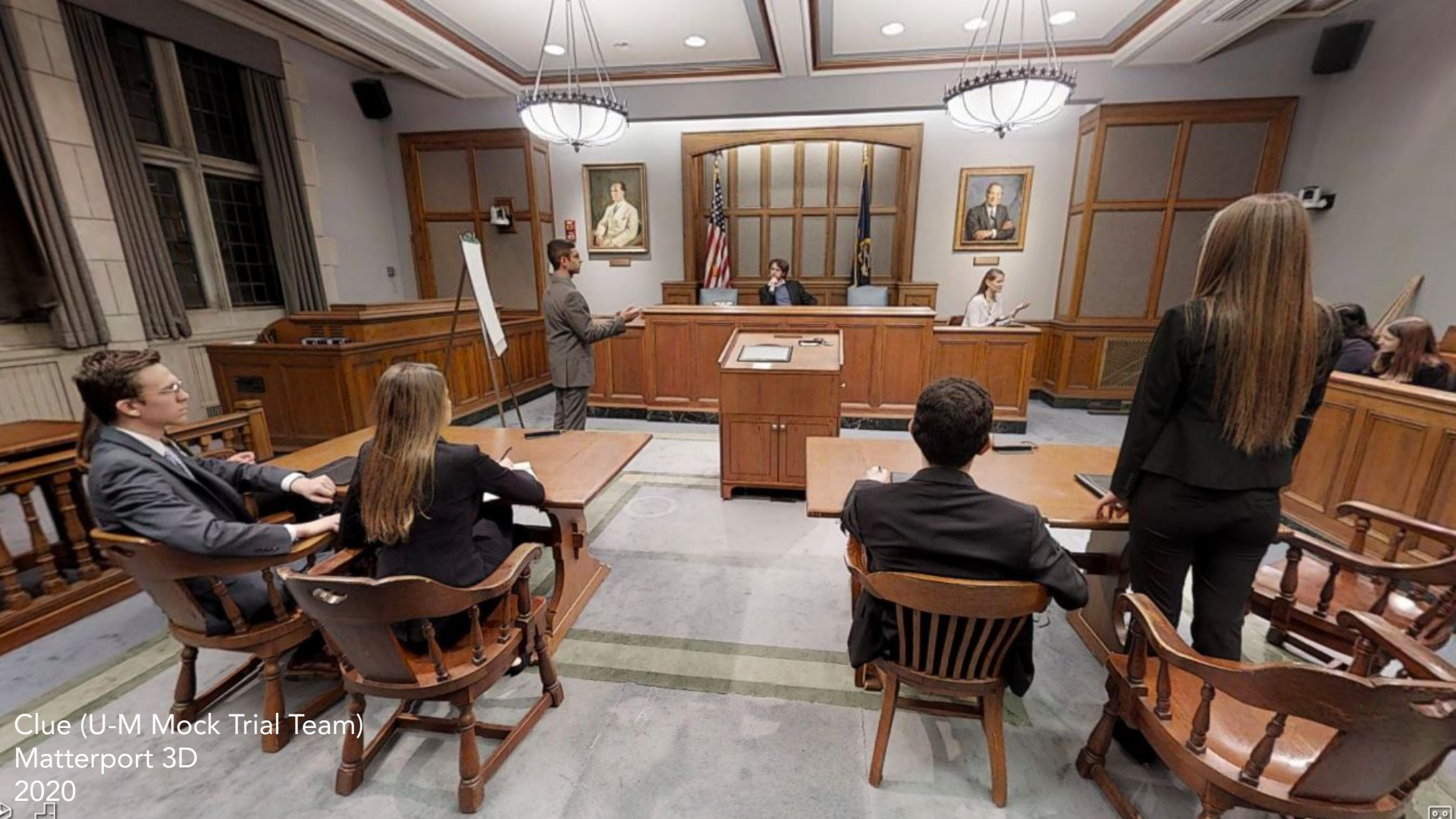
Clue (U-M Mock Trial Team) Matterport 3D 2020