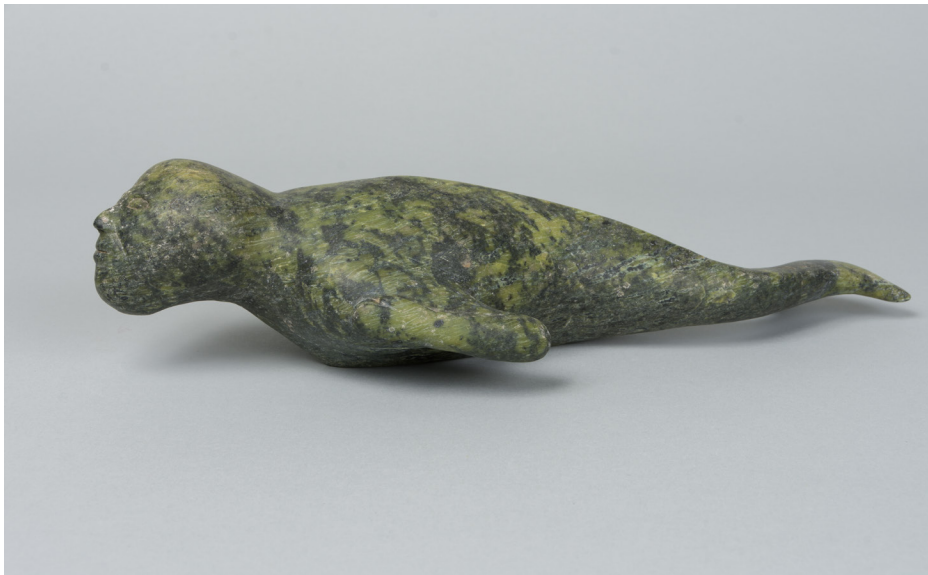
Saggiak, Cape Dorset, Sedna , ca. 1964, Stone

In Inuit sculpture, some images refer to stories like Sedna, and others portray the magical transformation of animals into people and people into animals.