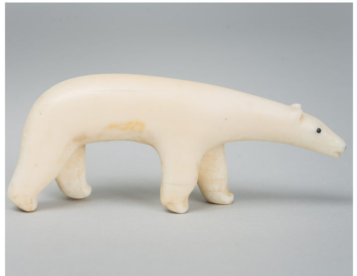
Artist Unknown, Walking Bear , ca. 1935, ivory

Inuit sculpture and carvings are made from natural materials such as bone, driftwood, stone, and ivory. They represent a variety of subjects including daily life, relationships between parents and children, and animals in their environment. The depiction of animals varies stylistically, but Inuit artists have a keen sense of the physical characteristics from their close observation. For example, they capture the shifting weight of the polar bear and the lumbering musk ox in a smooth soapstone sculpture.