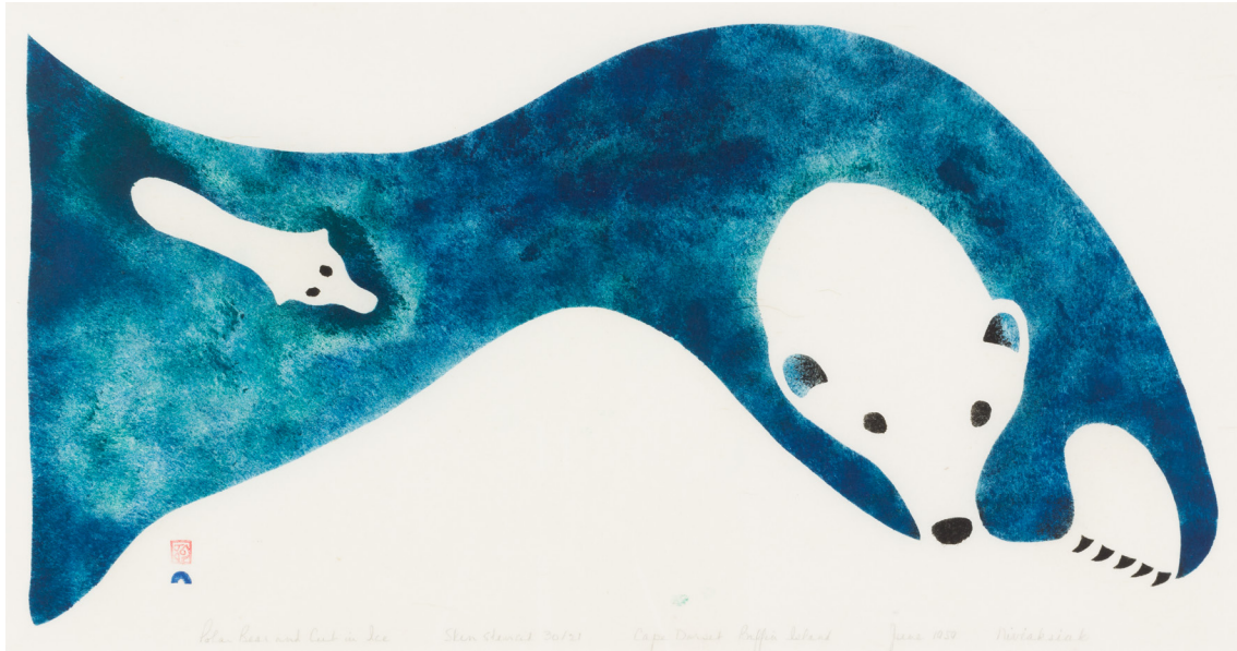
Niviaksiak, Cape Dorset, Polar Bear and Cub in Ice , 1959, Stencil on paper