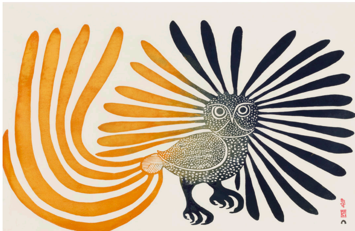
Kenojuak Ashshevak, Cape Dorset, The Enchanted Owl , 1960, Stonecut