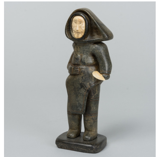
Artist Unknown, Kimmirut, Standing Woman ca. 1950, Stone, Ivory