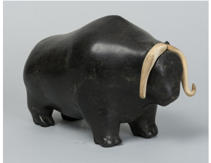
Mark Tungilik Repulse Bay, Muskox ca. 1965, Stone, antler

Inuit sculpture and carvings are made from natural materials such as bone, driftwood, stone, and ivory. They represent a variety of subjects including daily life, relationships between parents and children, and animals in their environment. The depiction of animals varies stylistically, but Inuit artists have a keen sense of the physical characteristics from their close observation. For example, they capture the shifting weight of the polar bear and the lumbering musk ox in a smooth soapstone sculpture.