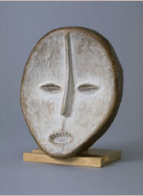
Artist unknown, African, Lega Peoples Democratic Republic of the Congo, Bwami Society Maskette , 1900–1975, wood, kaolin, UMMA, Gift of the Friends of the Museum of Art in memory of Diana B. Fox, 1985/1.151