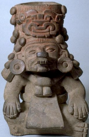
Artist unknown, Mexican, Monte Alban III (Zapotec), Seated Figure , circa 800 A.D., ceramic, UMMA, Museum Purchase made possible by a gift from Helmut Stern, 1983/1.356

Make sure to monitor student progress during Step 2. You can limit the activity to just one gallery, which will make it logistically easier to keep track of the students and control content.