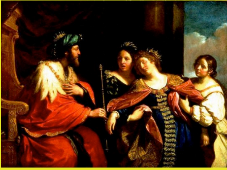
Guercino (Giovanni Francesco Barbieri), Esther before Ahasuerus , 1639, oil on canvas, UMMA, Museum Purchase, 1963/2.45