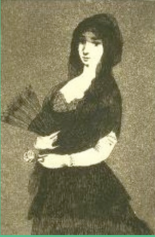
Édouard Manet, Exotic Flower; Woman Wearing a Mantilla , 1868, etching and aquatint, UMMA, Museum Purchase made possible by the Friends of the Museum of Art, 1985/1.166