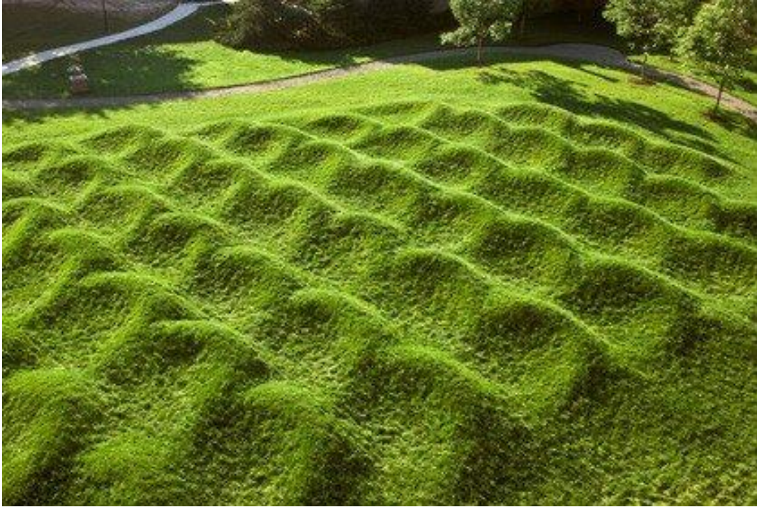
Wave Field, UM North Campus, by Maya Lin