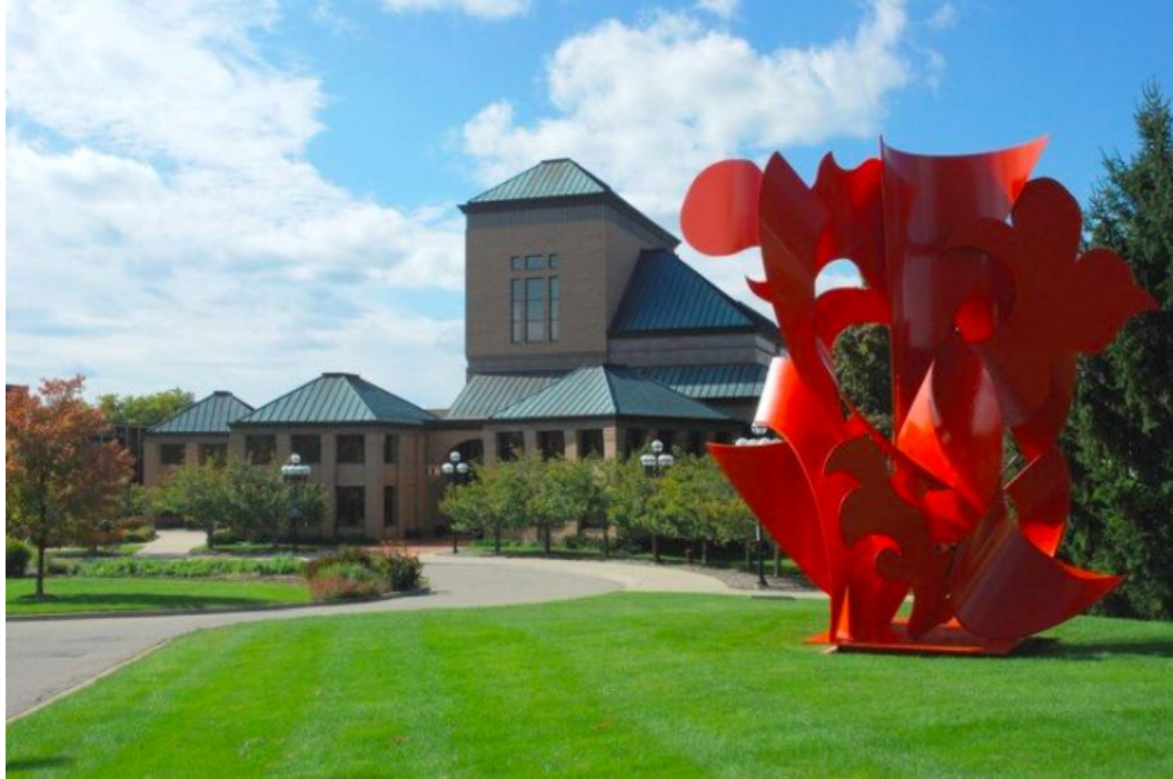
Begob, by Alexander Liberman