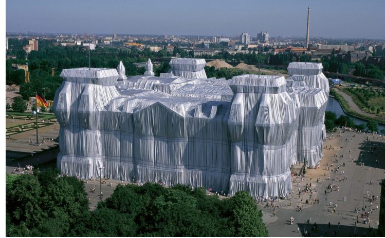
Galerie, by Christo & Jean-Claude