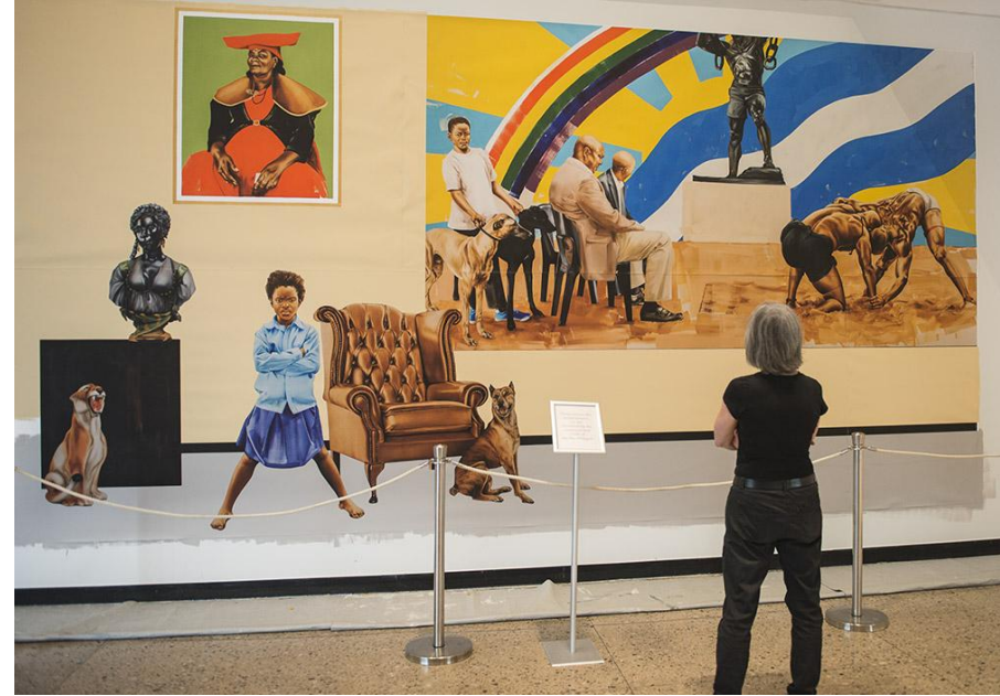
Pan-African Pulp, Meleko Mokgosi (UMMA)