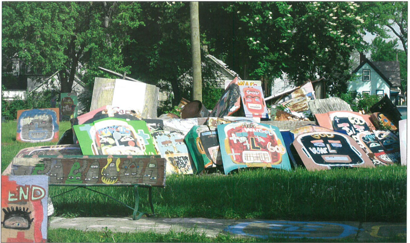
Faces in the Hood . 1994–present.