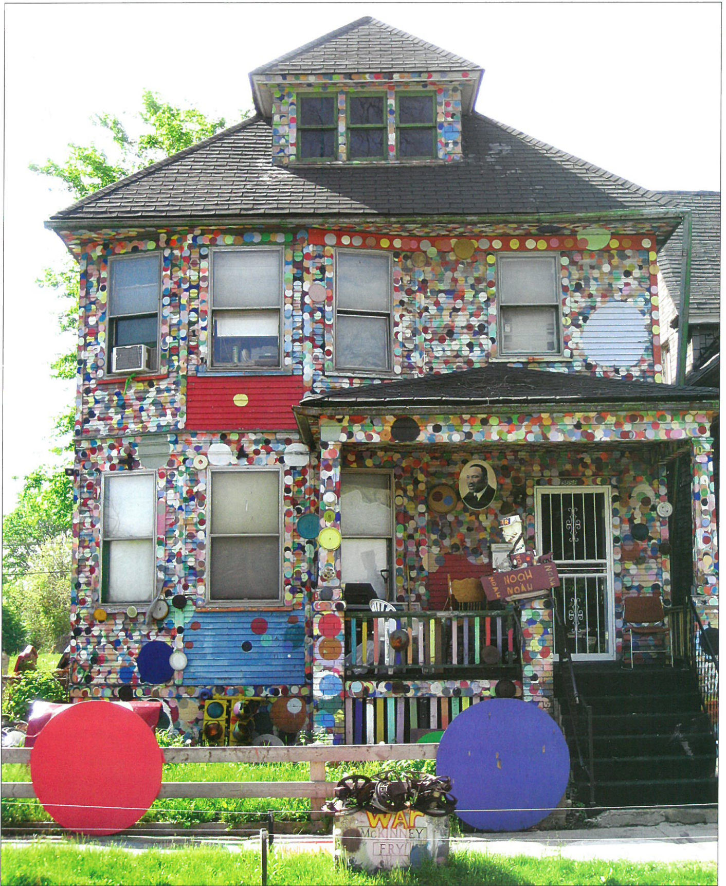
Dotty Wotty House, 1993–2001.