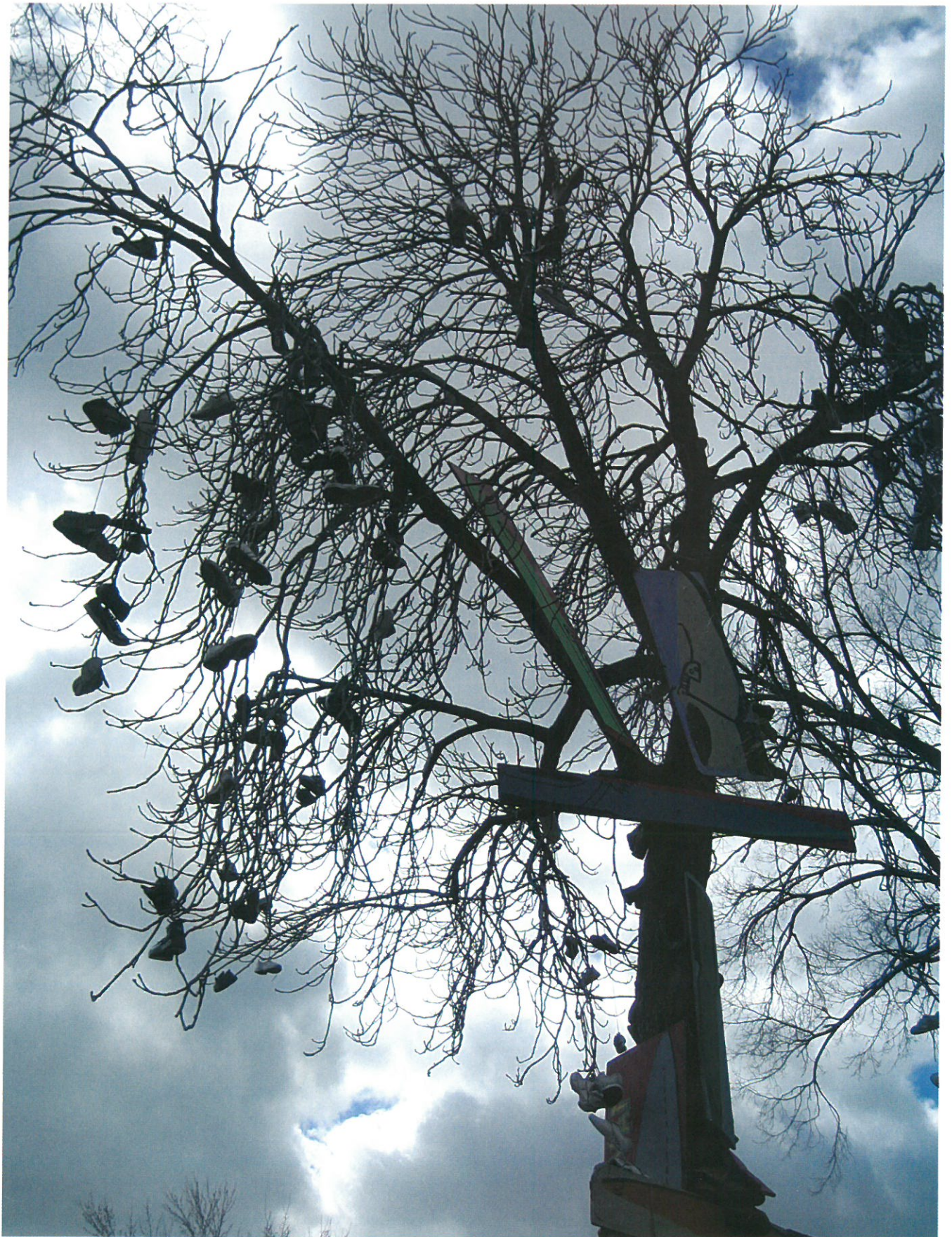
Soles of the Most High. 1993–present.