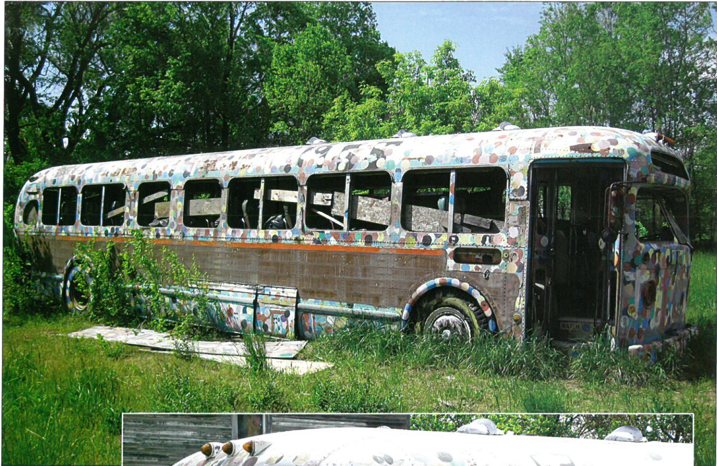
Move to the Rear. 1994–2000, current view.